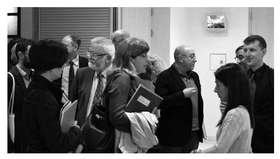
Participants arriving at the meeting